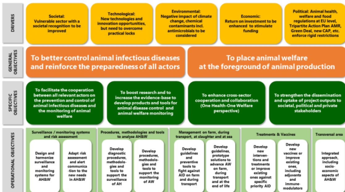
Figure 1. Intervention logic of the EUPAHW SRIA 4 : General Objectives are related to all societal, environmental, and economic drivers. Similarly, all Specific Objectives (SO) relate to both GO and most of the Operational Objectives can be linked to all SOs.

These Operational Objectives are grouped into five high-level Priority Areas (see Figure 2). The priority areas can be seen as successive, multi-disciplinary steps from detecting and characterising health and welfare issues to actions in the field for prevention and recovery. The nine OOs for the R&I agenda, organised per corresponding priority area, are shown in the overview of the intervention logic of the EUPAHW (Fig. 1)